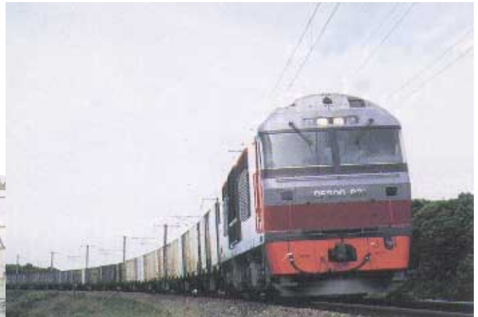
■ Class DF200 Diesel Locomotive (JR Freight)