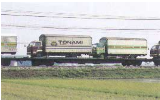
■ Piggyback Train on Sanyo Line (The trucks are 4 tons each.) (H. Morokawa)