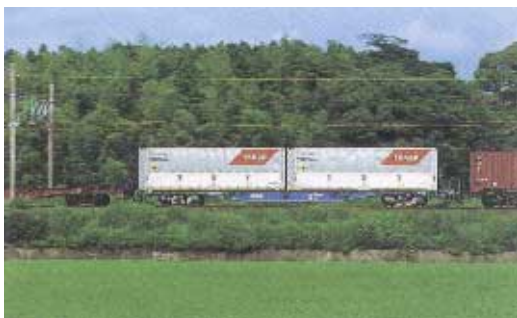
■ 30-ft Containers on Tokaido Line (H. Morokawa)