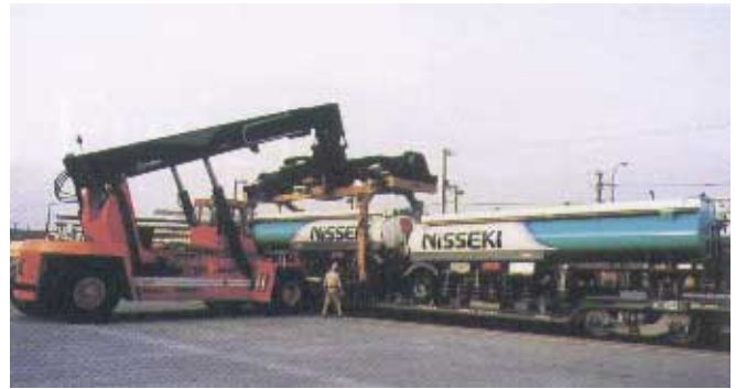
■ Loading Tanker Semi Trailers with Crane