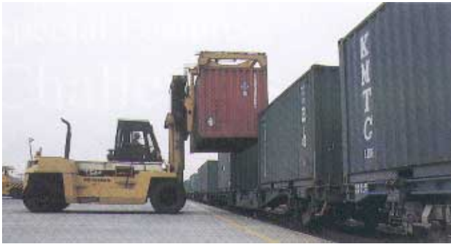
■ Loading Containers with Fork Lift