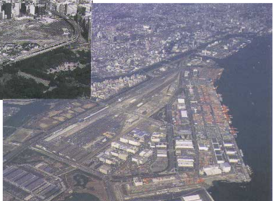
■ Tokyo Freight Terminal