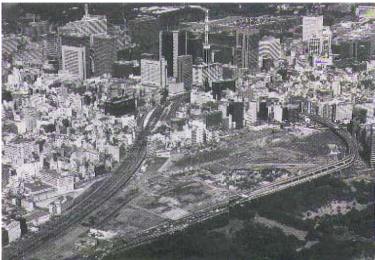
■ Shiodome Freight Yard

Tokyo's old freight yard at Shiodome is very close to the main business areas and is under redevelopment. All freight activities have been moved to Tokyo Freight Terminal on reclaimed land near Tokyo Port.