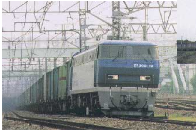
■ Class EF200 DC Locomotive Running on Takaido Line (JR Freight)