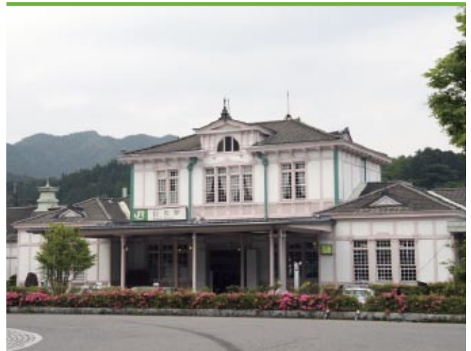
Front of Nikko Station

Nikko is a famous tourist spot with its natural beauty and historic sites. It is home to the Toshogu, Futarasan Shrine, and Rinno-ji and other UNESCO world Heritage Sites. Nikko Station opened in 1890 to serve tourists visiting the various historical monuments and nature of Nikko area. It is still an active station and the stately exterior remains unchanged from when first constructed. It is one of the most beautiful station buildings in Eastern Japan. Both the VIP room on the ground floor used by the Taisho Emperor (1876–1926) and the first-class waiting room on the first floor are still in their original condition. The chandelier and marble fireplace in the VIP room create a dignified atmosphere. The waiting room is used for various public events.