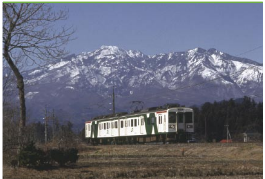
Series 107 running on Nikko Line