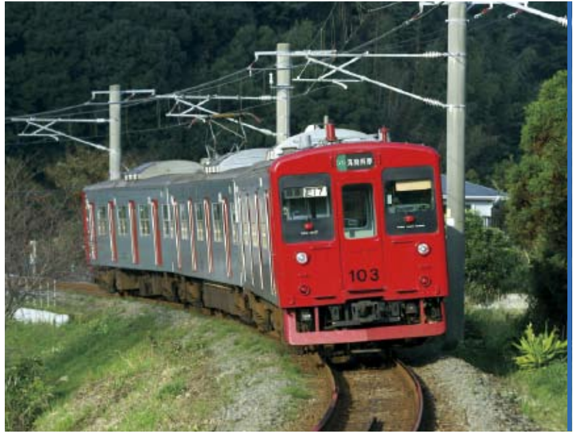
Series 103 running on Chikuhi Line

The 68.3-km (passenger-km) Chikuhi Line was opened by the private Kitakyushu Railway in 1923 to connect Meinohama Station in Fukuoka City, Fukuoka Prefecture, with Imari Station in Saga Prefecture. It was nationalized in 1937 when some stations were renamed and other stations and sections closed. 1983 saw electrification, opening of new stations, and closing of stations between Hakata and Meinohama following the opening of Fukuoka City Subway. Freight operations were also stopped. The line became part of JR Kyushu at the 1987 Japanese National Railways privatization and division.