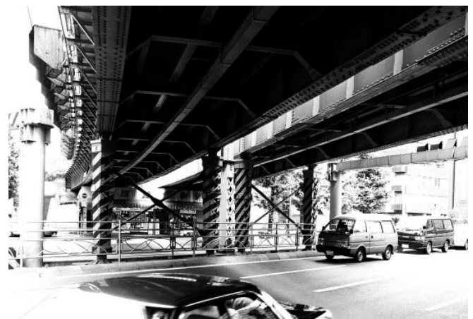
Manseibashi bridge on Chuo Line