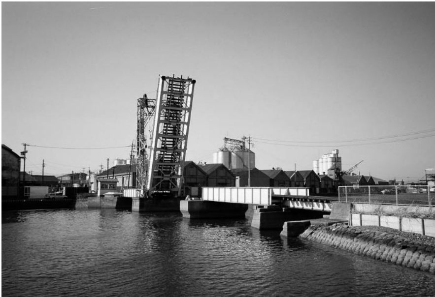
JR Freight's Suehiro Bridge at Yokkaichi—bascule movable bridge (1931)