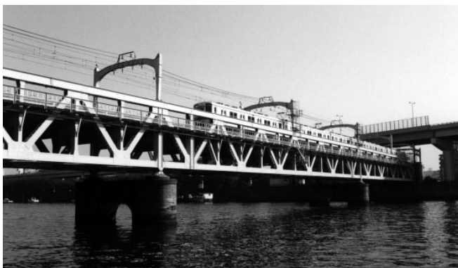
Sumidagawa Bridge on Tobu Line (Author)