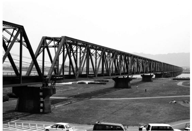
Yoshinogawa Bridge on Kotoku Line