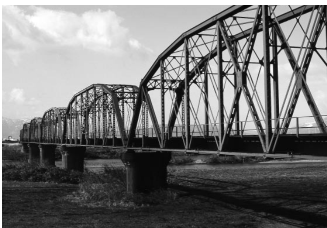
American pin-jointed truss girders of Ibigawa Bridge (1900) on Tarumi Railway

Imports were relied on for truss girders because the tension members called eye bars for pin-jointed trusses were hard to manufacture. However, from about 1905, the Governor-General of Taiwan Railways, commissioned mass-production in Japan of pin-jointed truss girders designed by Cooper and Schneider that were the same design as those of the government railways. This suggests that the government railways probably did not trust private-sector