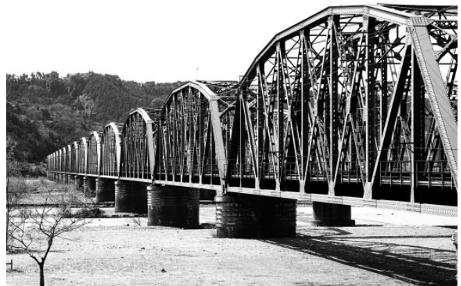
Oigawa Bridge, Tokaido Line with 200-ft truss for live load E45 (Author)

100-ft girders. A total of 22 were used on bridges over the Tonegawa, Ibigawa, Nagaragawa, and Kisogawa.