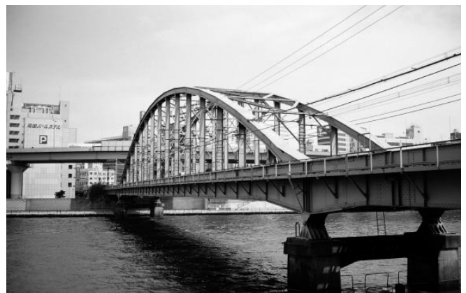
Sumidagawa Bridge (1932) on Sobu main line (Author)