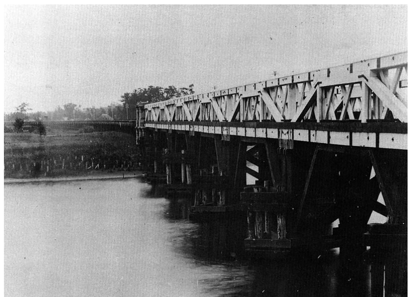
First Rokugogawa wooden bridge (1872) on Shimbashi-Yokohama Line (Institut des Hautes Etudes Japonaises, College de France)