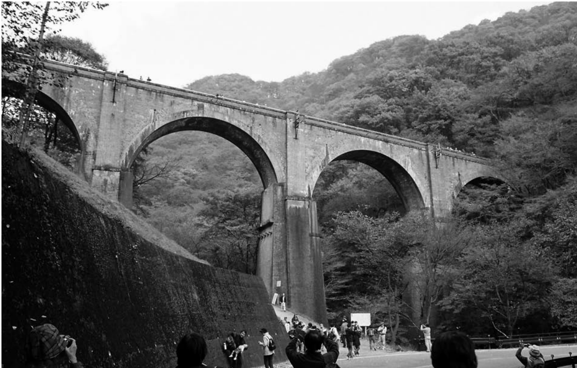
Usui No. 3 Bridge of old Shinetsu Line (1892), now used as foot bridge for walking trail