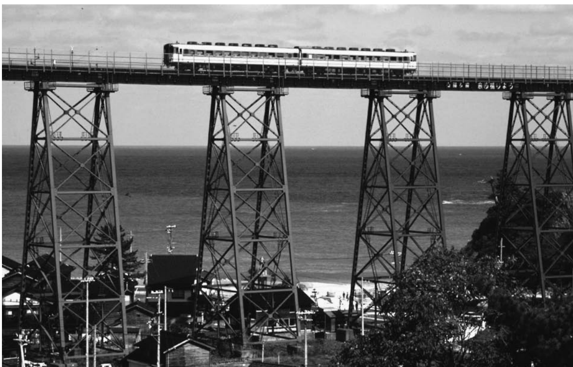
Former Amarube Viaduct constructed in 1912 and dismantled in 2010