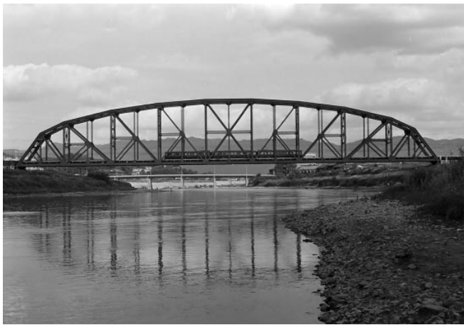
Yodogawa Bridge (1928) on Kyoto Line of Kintetsu Railway