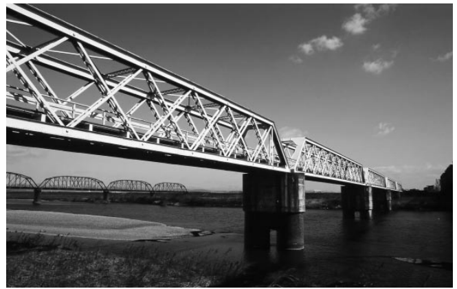
Ibigawa Road Bridge (1887) converted from Tokaido Main Line Railway Bridge