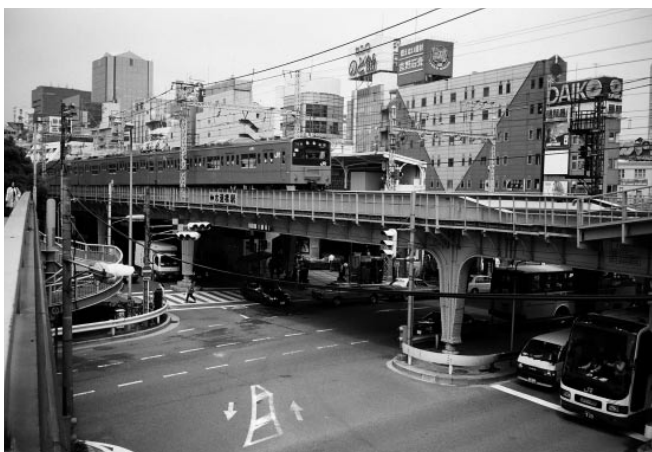
Suidobashi viaduct (1931) over Hakusan Street

In 1932, a truss girder was designed and constructed that was bent at the panel points to match the 300-m radius of the line at the Iyogawa Bridge on the Dosan Line.