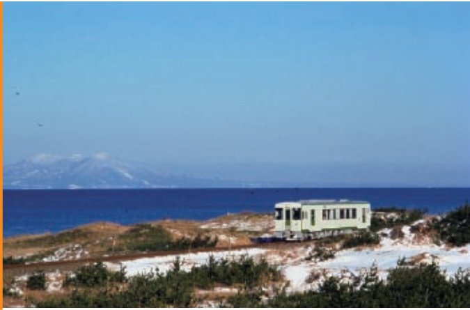
JR East's Kiha 100 diesel railcar running on Ominato Line from Ominato to Noheji in northeast Japan