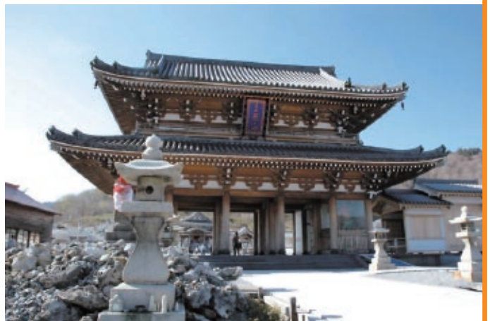
Osorezan Bodaiji Temple gate

Osorezan (meaning Mt Fear) is the name of a holy somma volcano cone surrounding Lake Usori on the Shimokita peninsula in northeast Japan. The Buddhist priest Jikaku Daishi (aka Ennin 794(?)–864) opened the Osorezan Bodai Temple on the mountain in 862. Since then, the mountain has been worshipped as a Shinto god. Osorezan is popular with tourists seeking to enjoy its hot springs and to meet the female shaman priests.