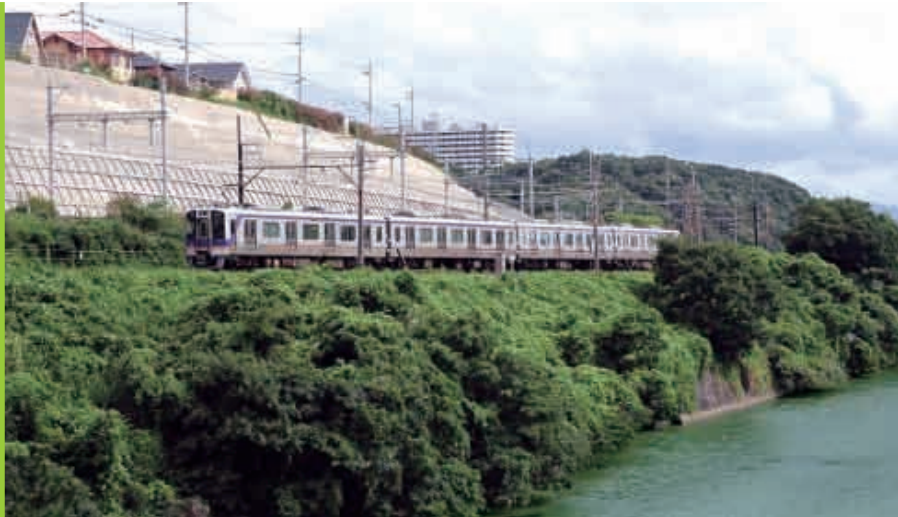
Series 8000 rolling stock on Nankai main line