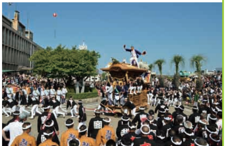
4-tonne danjiri parading through city

The danjiri matsuri (float festival) is held in Kishiwada, Osaka, during September and October. It is said to originate from a festival held by the feudal lord of Kishiwada to pray for a good harvest. Each neighbourhood holds its festival lasting 2 days. On the first day, 4-tonne danjiri belonging to each neighbourhood parade through the city. On the second day, groups of men parade their danjiri and take them to a neighbourhood shrine. The second day is considered a highlight of the festival before the danjiri are stored for another year.