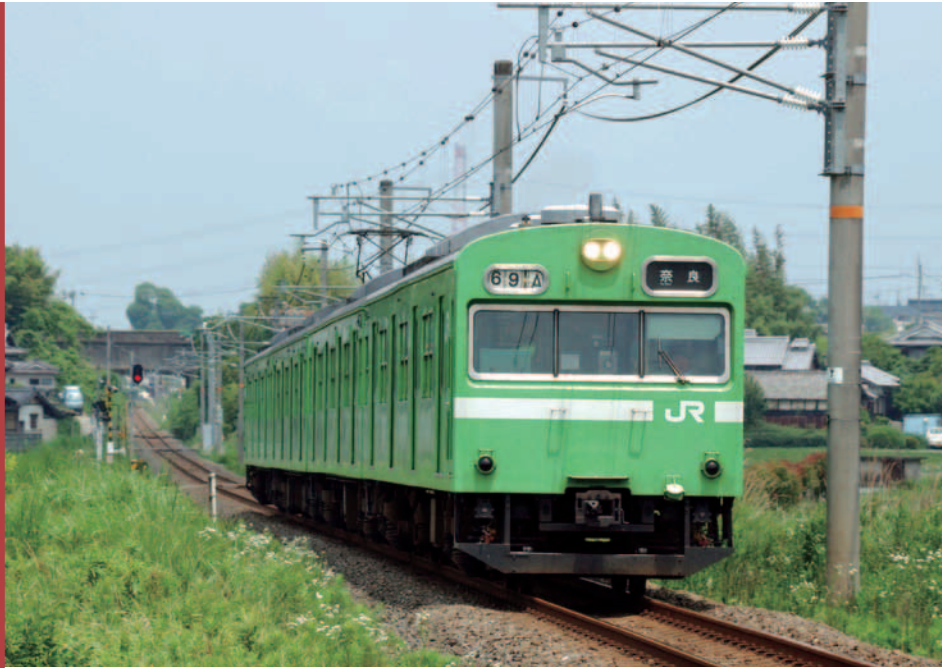
Series 103 running in the JR West Nara Line