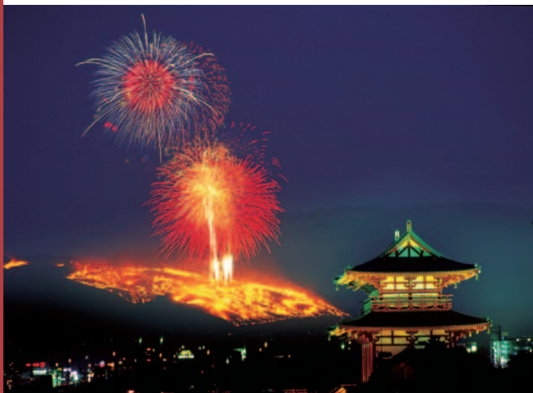
Mt. Wakakusa Fire Festival