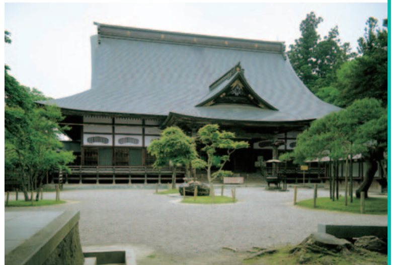
The main hall of Chuson-ji, one of the major temples in Hiraizumi

Hiraizumi is in Iwate Prefecture, northeast Japan. It was the capital of the Oshu Fujiwara family, the ancient clan who governed most of northeast Japan and was at the height of its prosperity in the 11th to 12th centuries. There are various temples and gardens representing the idea of 'Pure Land Buddhism' in Hiraizumi. These historic sites were listed as UNESCO World Cultural Heritage sites in June 2011. Hiraizumi Station on the JR East Tohoku main line, the gateway to this historic area, was renovated following the 'Zero Emission Station' concept in June 2012.