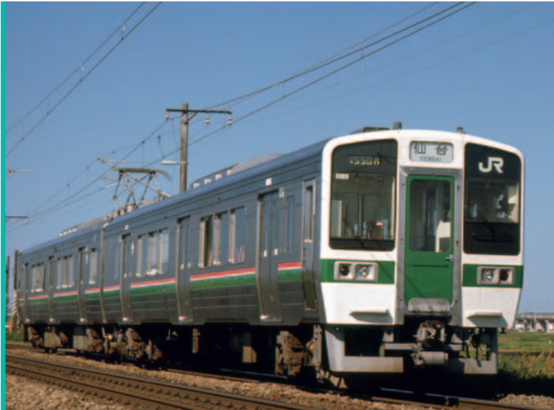
Tohoku main line bound for Sendai